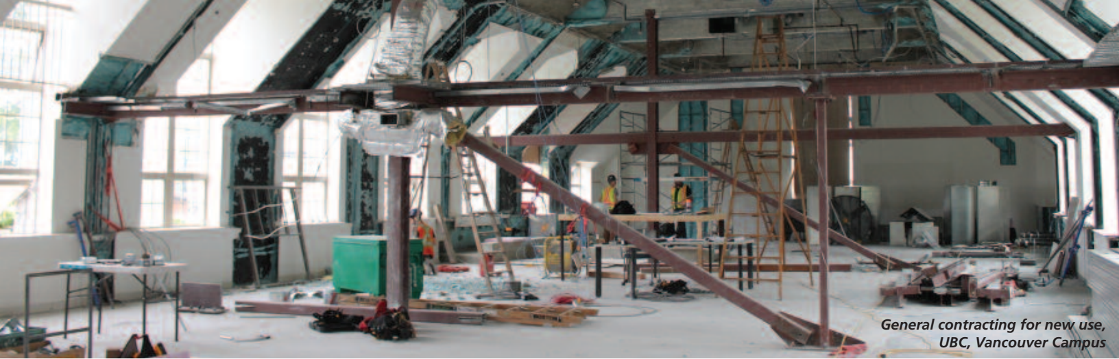
General contracting for new use, UBC, Vancouver Campus