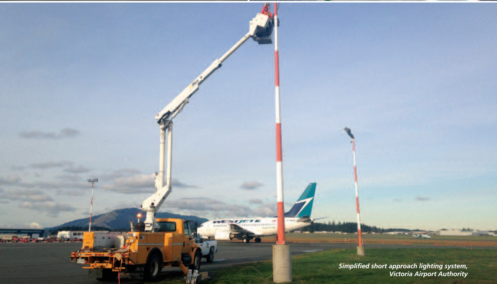
Simplified short approach lighting system, Victoria Airport Authority