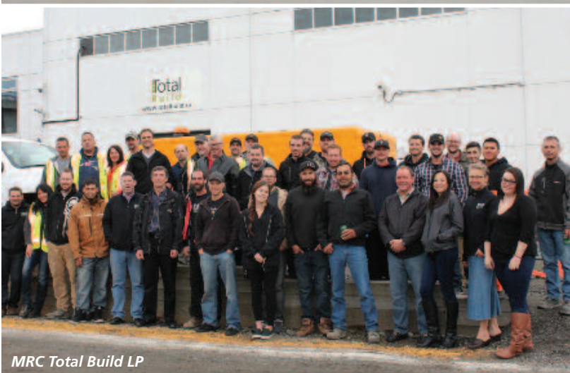
MRC Total Build LP