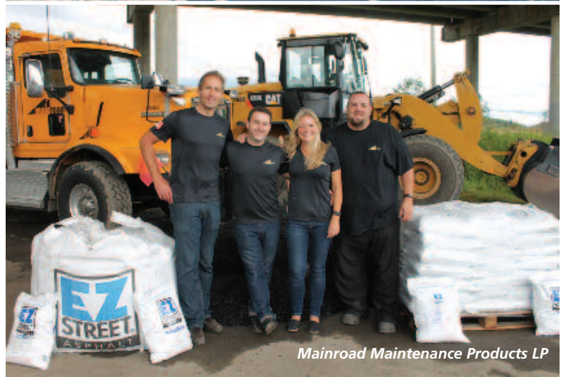
Mainroad Maintenance Products LP