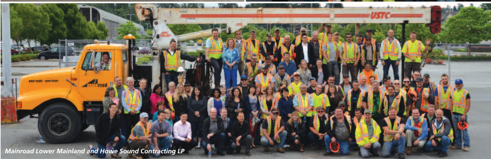
Mainroad Lower Mainland and Howe Sound Contracting LP