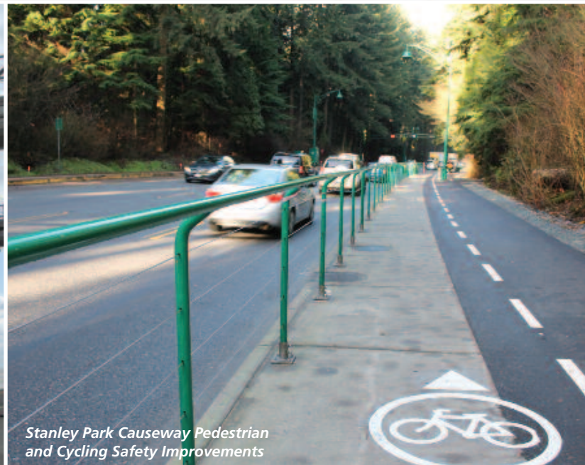
Stanley Park Causeway Pedestrian and Cycling Safety Improvements