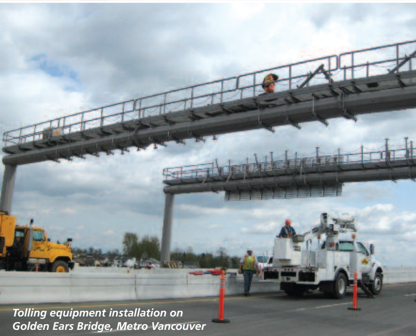
Tolling equipment installation on Golden Ears Bridge, Metro Vancouver