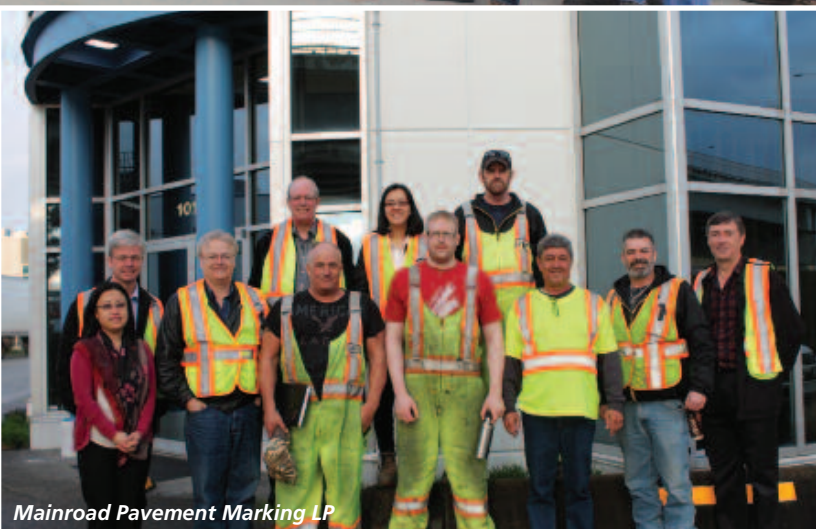
Mainroad Pavement Marking LP