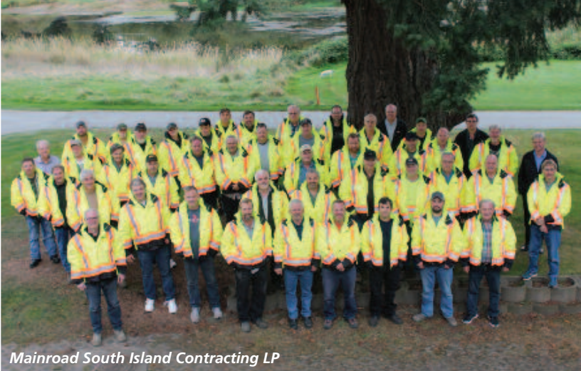
Mainroad South Island Contracting LP