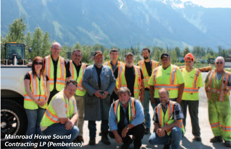
Mainroad Howe Sound Contracting LP (Pemberton)