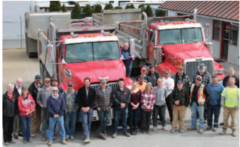
G&E Contracting LP