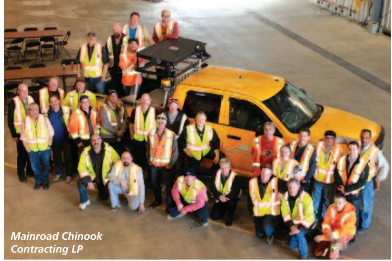
Mainroad Chinook Contracting LP

With a solid history, a wealth of experience, specialized knowledge, and the skills of our people, the Mainroad Group has built a successful foundation for its future.