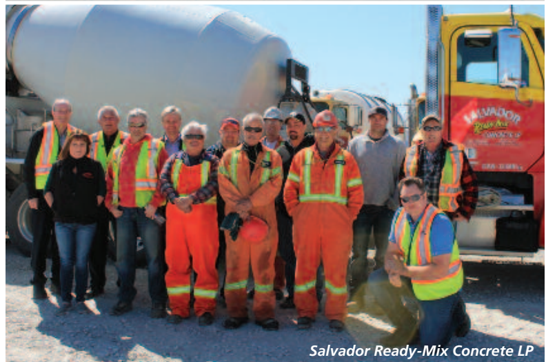
Salvador Ready-Mix Concrete LP