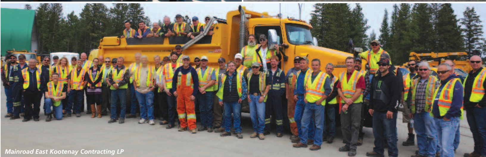
Mainroad East Kootenay Contracting LP