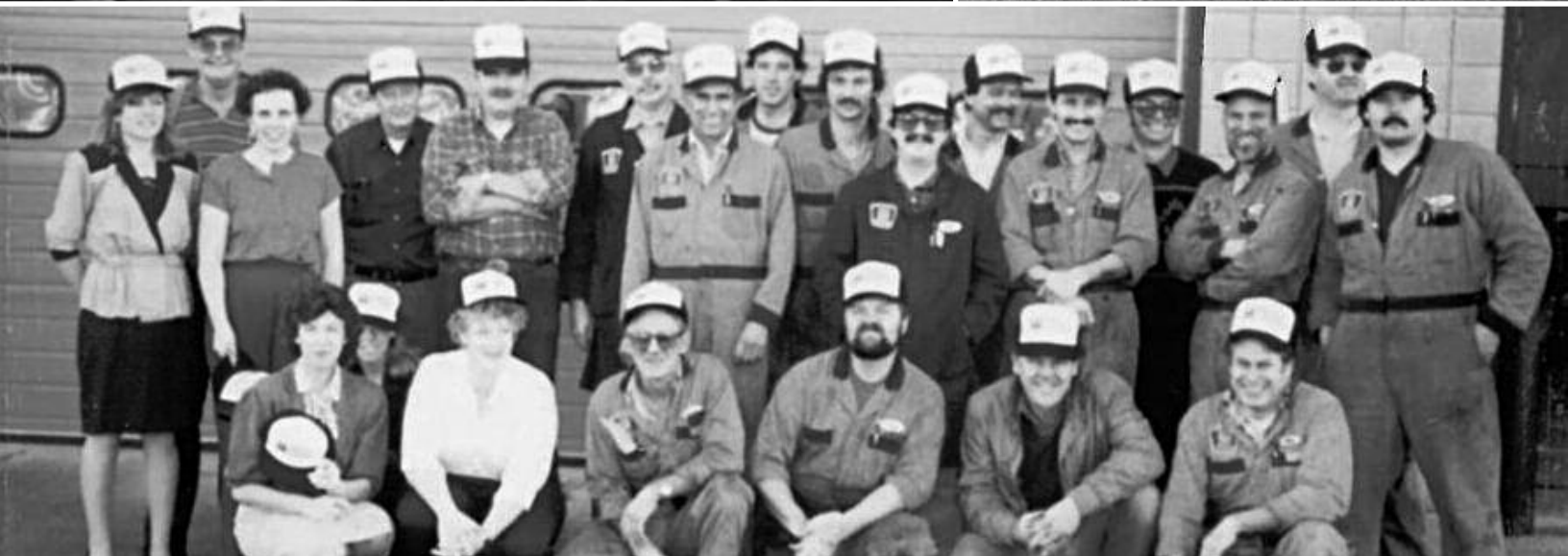
Some of the Founding Employees of Mainroad (1988)