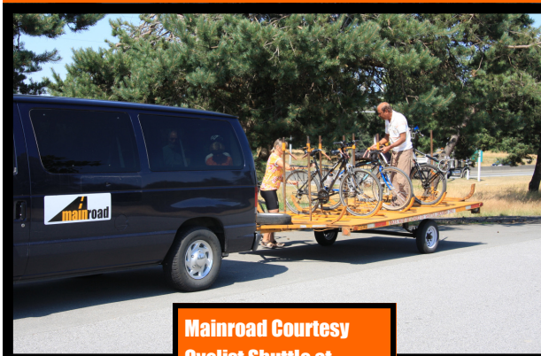
Mainroad Courtesy Cyclist Shuttle at George Massey Tunnel

Mainroad provides road and bridge maintenance services for major roadways across the Lower Mainland. We understand the importance of road safety for motorists, and cyclists alike. That is why the Ministry of Transportation and Infrastructure and Mainroad provide such services as the Cyclist Shuttle at the George Massey Tunnel on Highway 99.